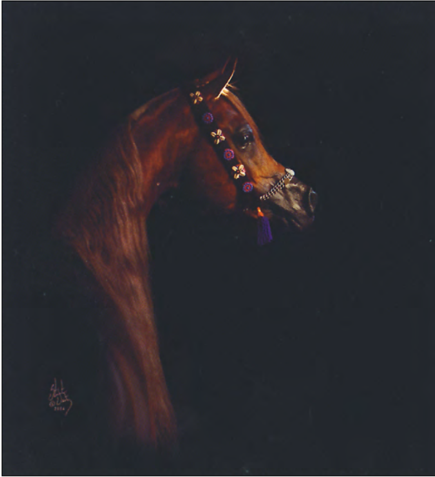
Magnum Psyche