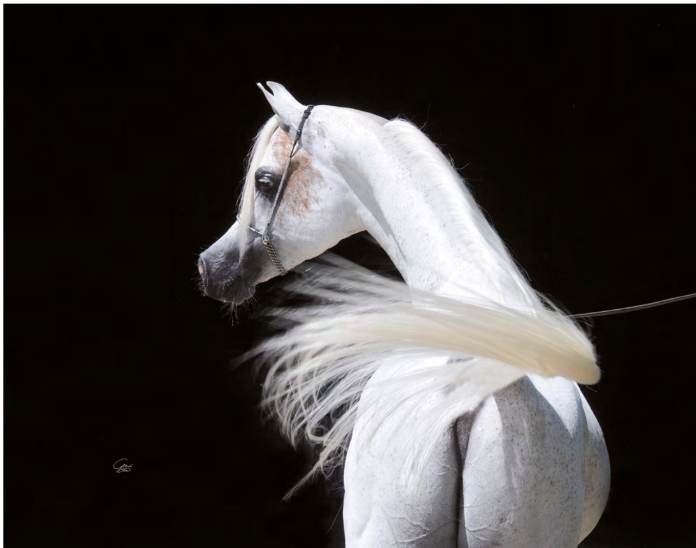
WH Justice

endless source of significant sires. Tracing back to the legendary Nazeer through his champion producing sire Magnum Psyche and grandsire Padrons Psyche, Justice inherited the title of Sire Supreme and his striking sons are next in line of succession. Tail female, it is quite the opposite; it is not easy to find show champions or prolific producers in Justice's dam line. However, his dam Vona Sher-Renea, who passed away in 2019 at the advanced age of 30, was a classic Arabian beauty sired by the powerfully moving El Shaklan son, El Sher-Mann (out of Gazira by Eldon), the senior stallion class winner at the 2000 All Nations Cup in Aachen. It makes Justice