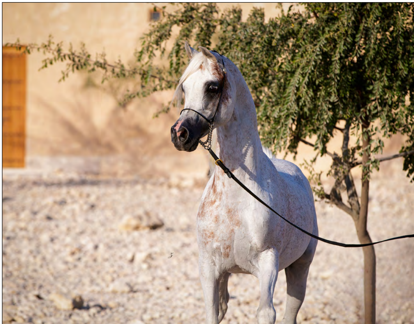
WH Justice