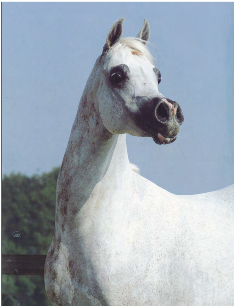
WH Justice