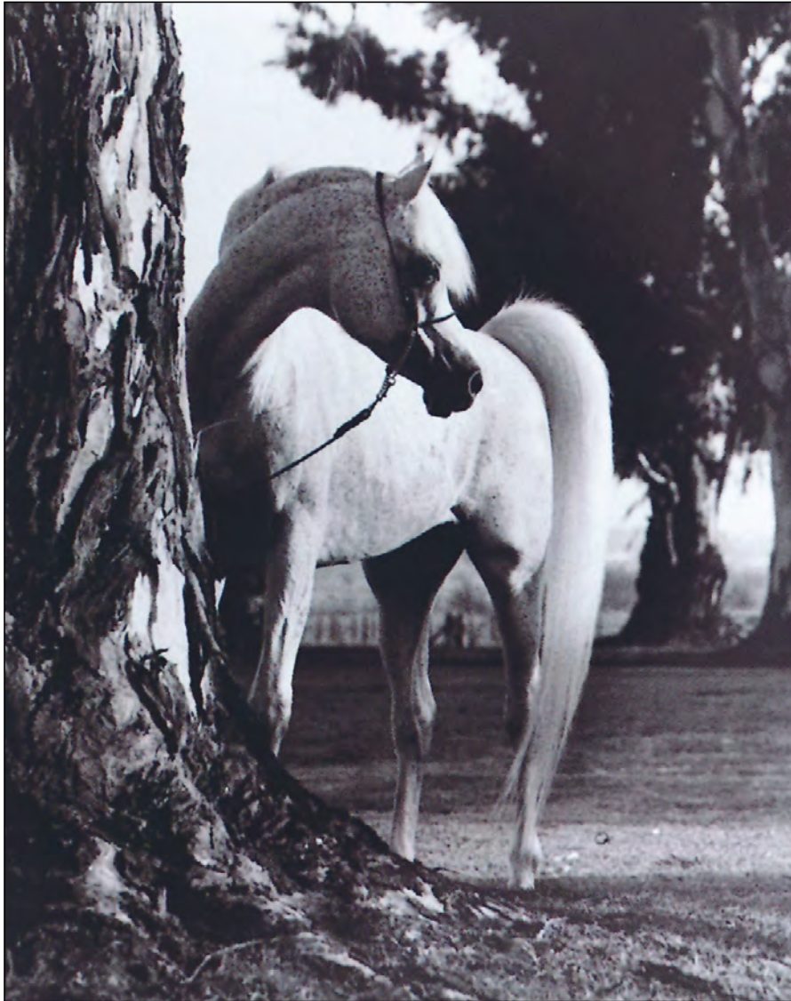
El Shaklan (Shaker El Masri x Estopa), WH Justice's great grand sire.