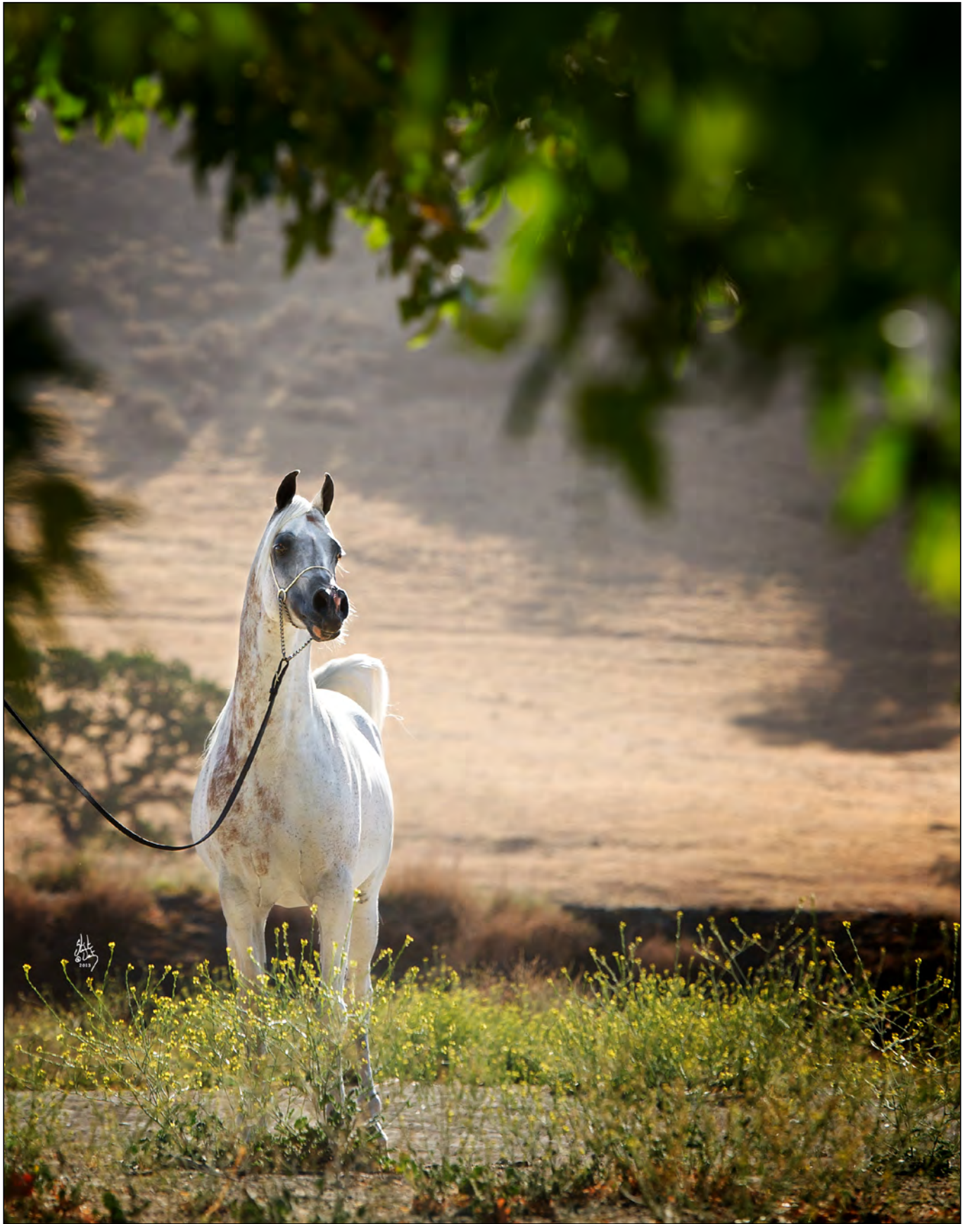
WH Justice