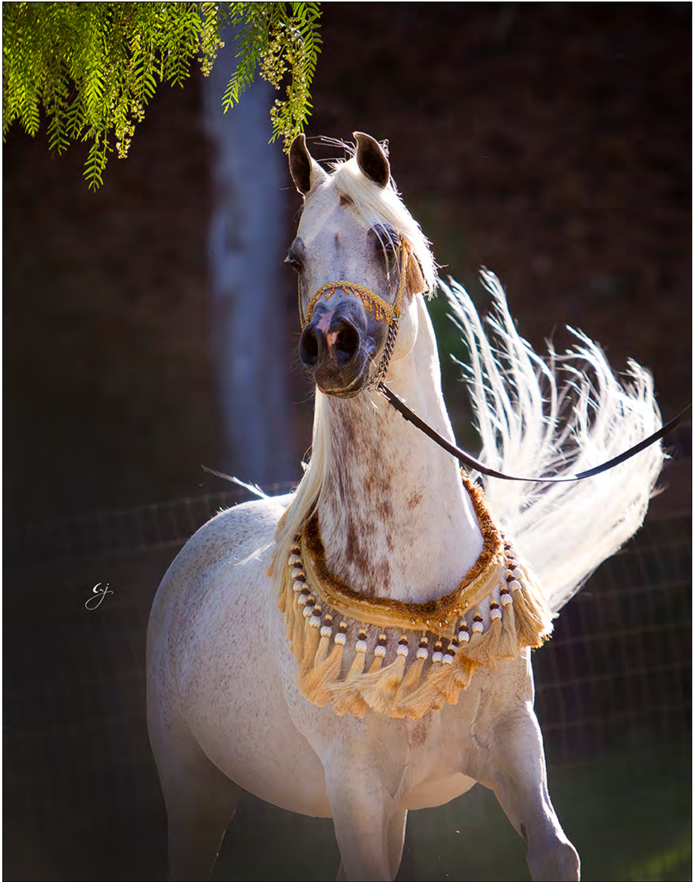
WH Justice