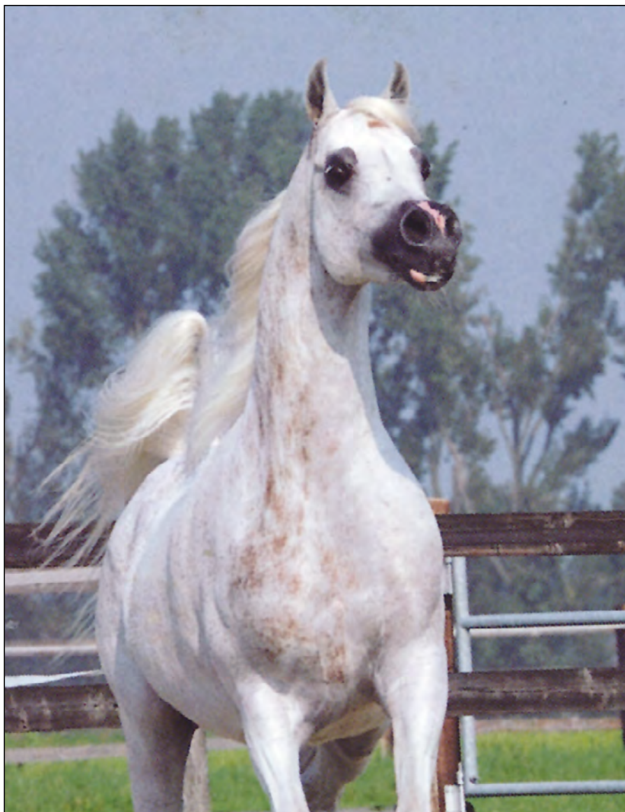
WH Justice