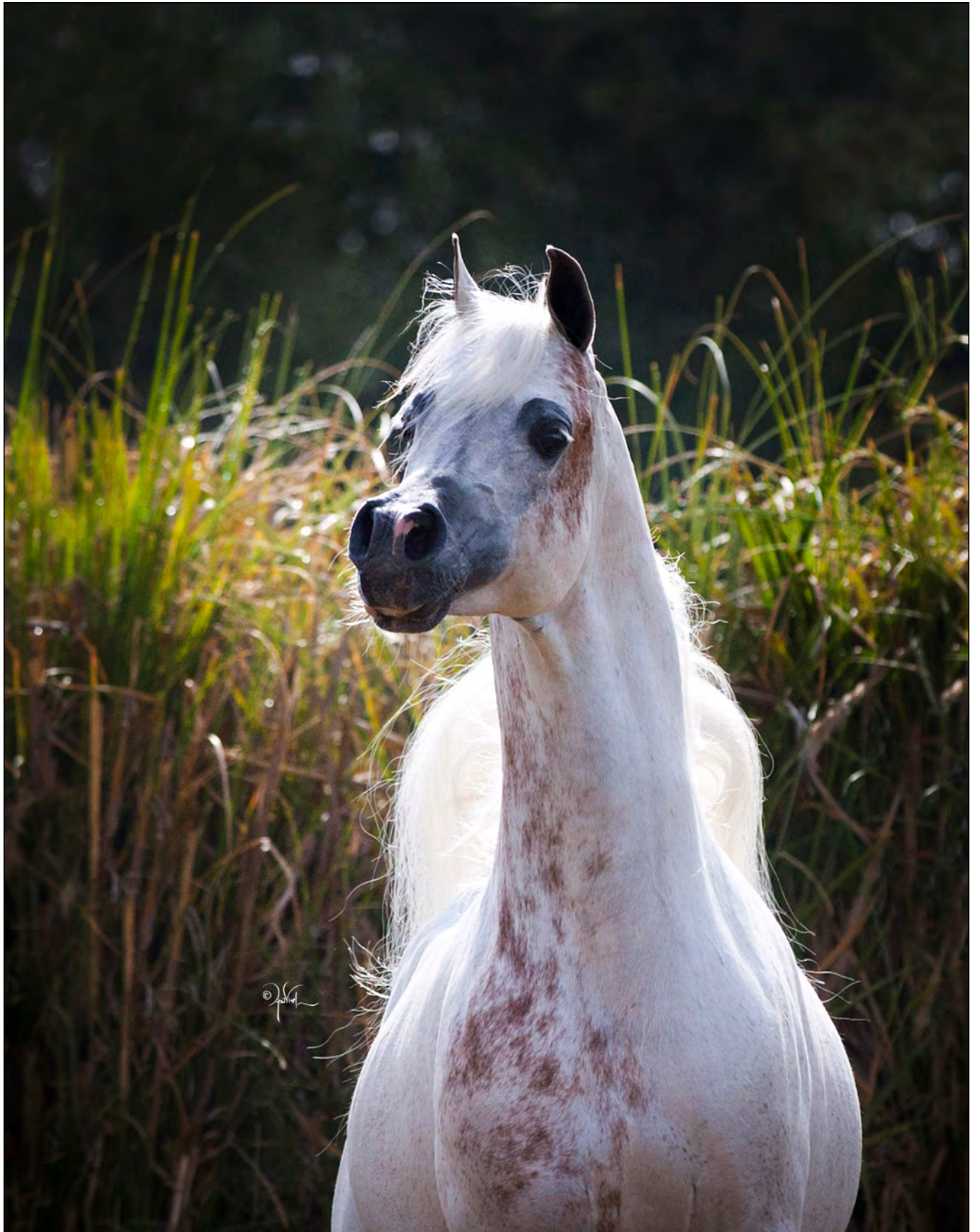
WH Justice