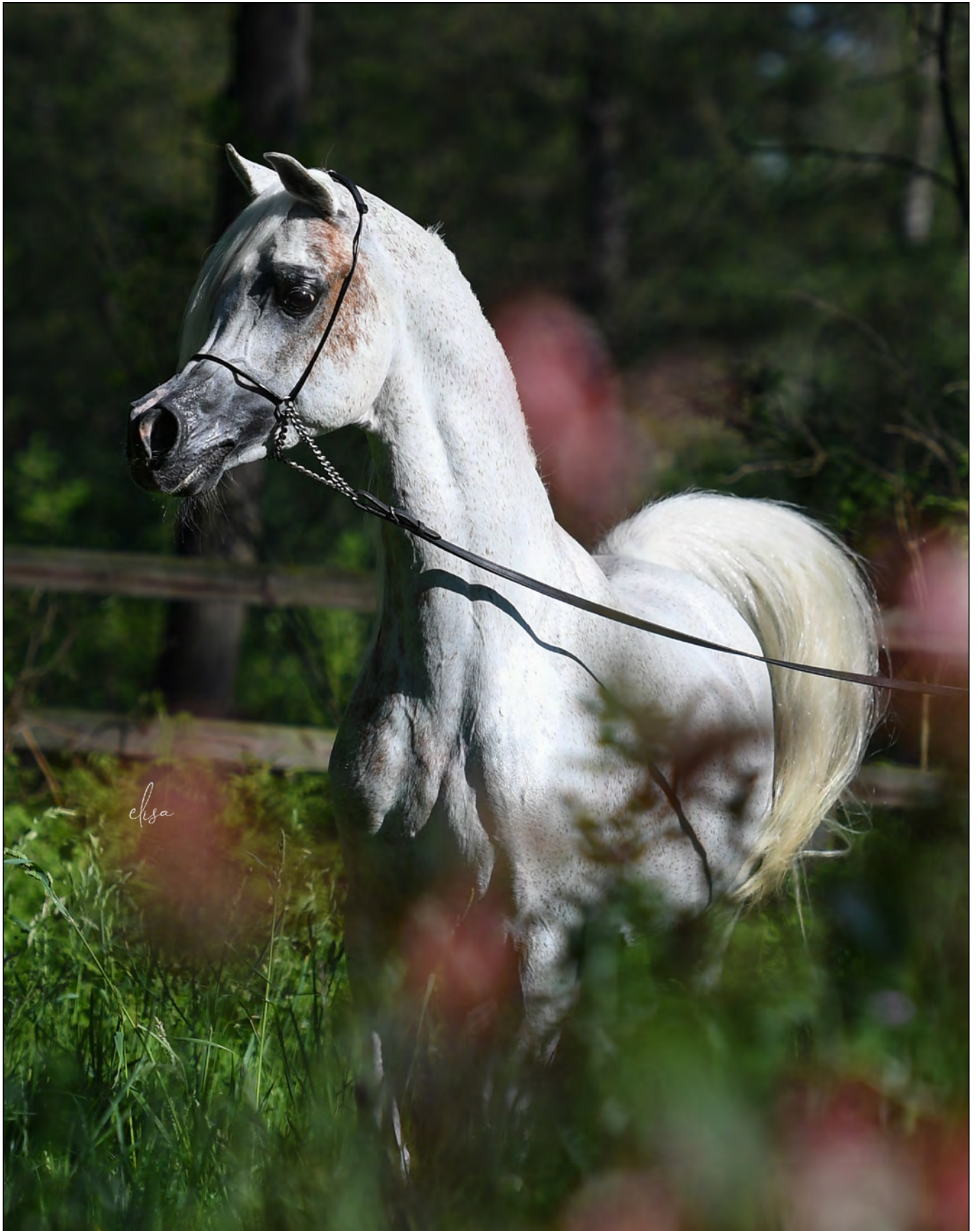
WH Justice (Magnum Psyche x Vona Sher-Renea)